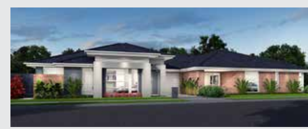
unit 1 contemporary