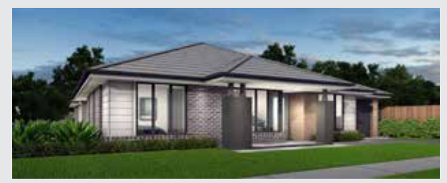
unit 2 classic