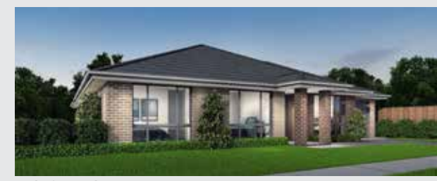
unit 2 modern