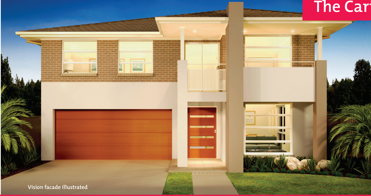
Vision facade illustrated