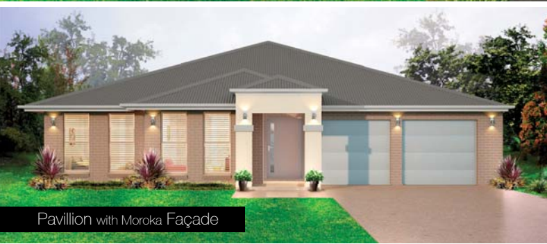
Pavillion with Moroka Façade