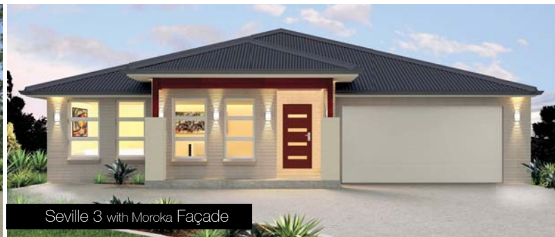
Seville 3 with Moroka Façade

The facades featured are for illustrative purposes only and may not depict actual inclusions included in prices. It is at the client's discretion to select inclusion features within the standard ranges and if optional upgrades are requested (subject to availability), additional costs will incur. Taubmans® Moroka finish is only included to facades where mentioned. Various facades may alter dimensions and structures to plans. Landscaping, driveway, fences, letterbox, light fixtures (internal and external), window coverings, decorative accessories, home furnishings and most appliances are not included in quoted prices (see inclusions page 10 for more details). Builders licence number 207765C.