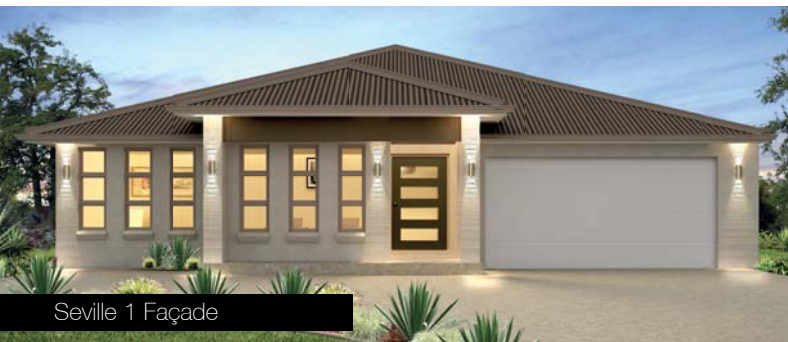
Seville 1 Façade