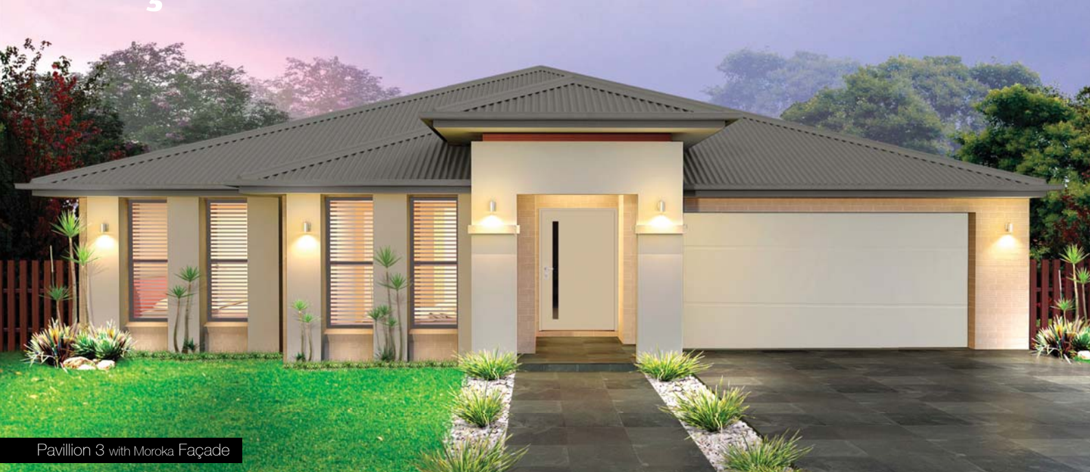
Pavillion 3 with Moroka Façade