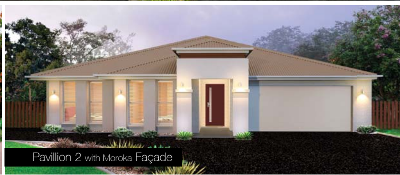
Pavillion 2 with Moroka Façade