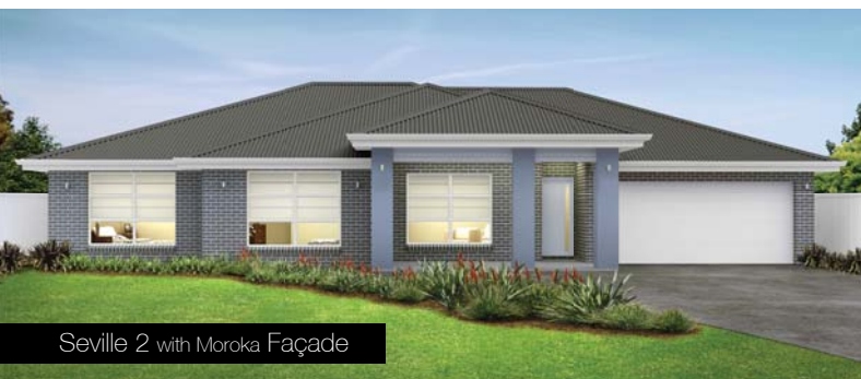
Seville 2 with Moroka Façade