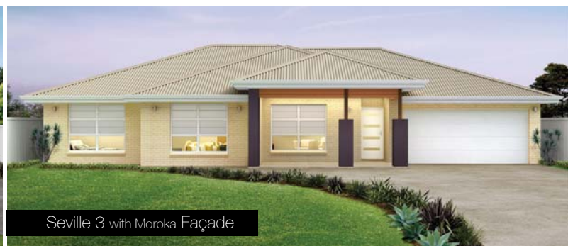
Seville 3 with Moroka Façade