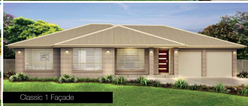
Classic 1 Façade

The facades featured are for illustrative purposes only and may not depict actual inclusions included in prices. It is at the client's discretion to select inclusion features within the standard ranges and if optional upgrades are requested (subject to availability), additional costs will incur. Taubmans® Moroka finish is only included to facades where mentioned. Various facades may alter dimensions and structures to plans. Landscaping, driveway, fences, letterbox, light fixtures (internal and external), window coverings, decorative accessories, home furnishings and most appliances are not included in quoted prices (see inclusions page 10 for more details). Builders licence number 207765C.