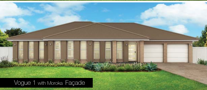
Vogue 1 with Moroka Façade