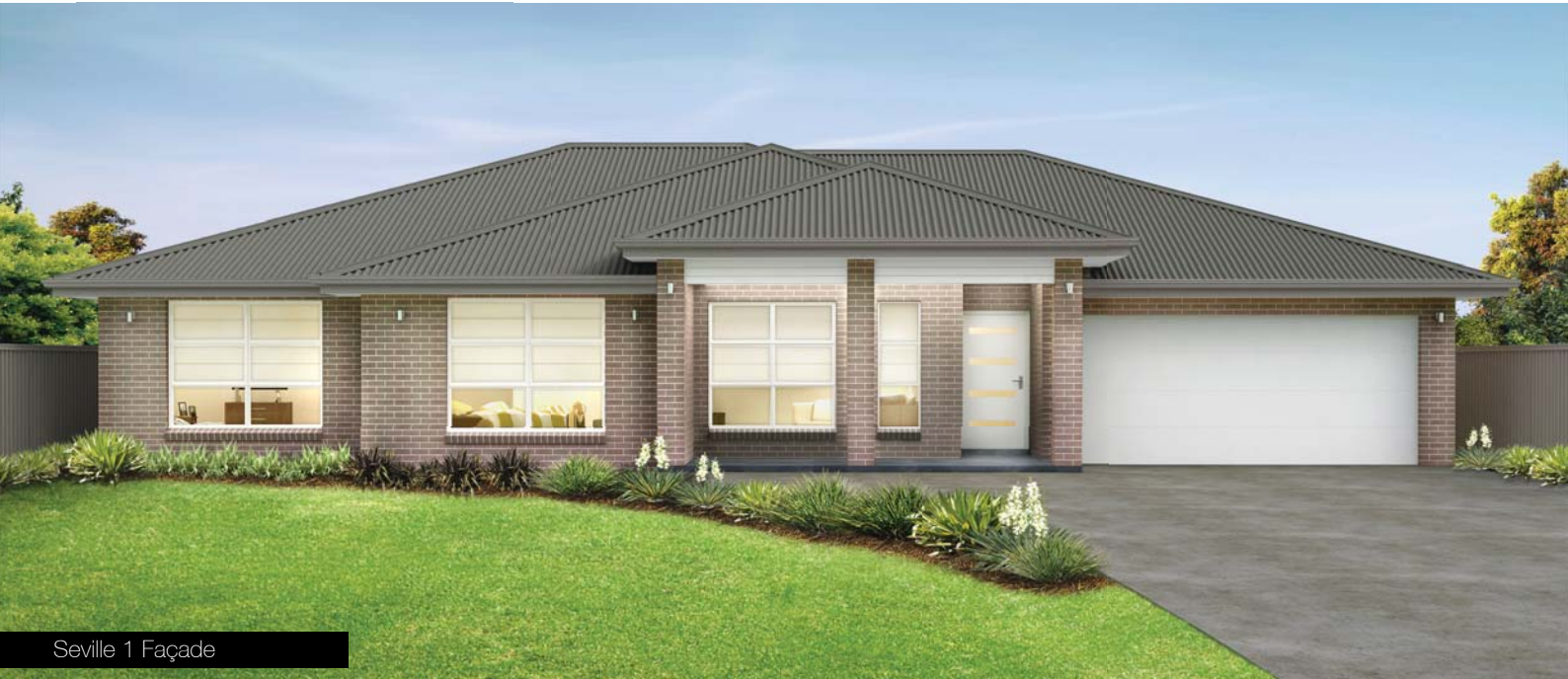
Seville 1 Façade