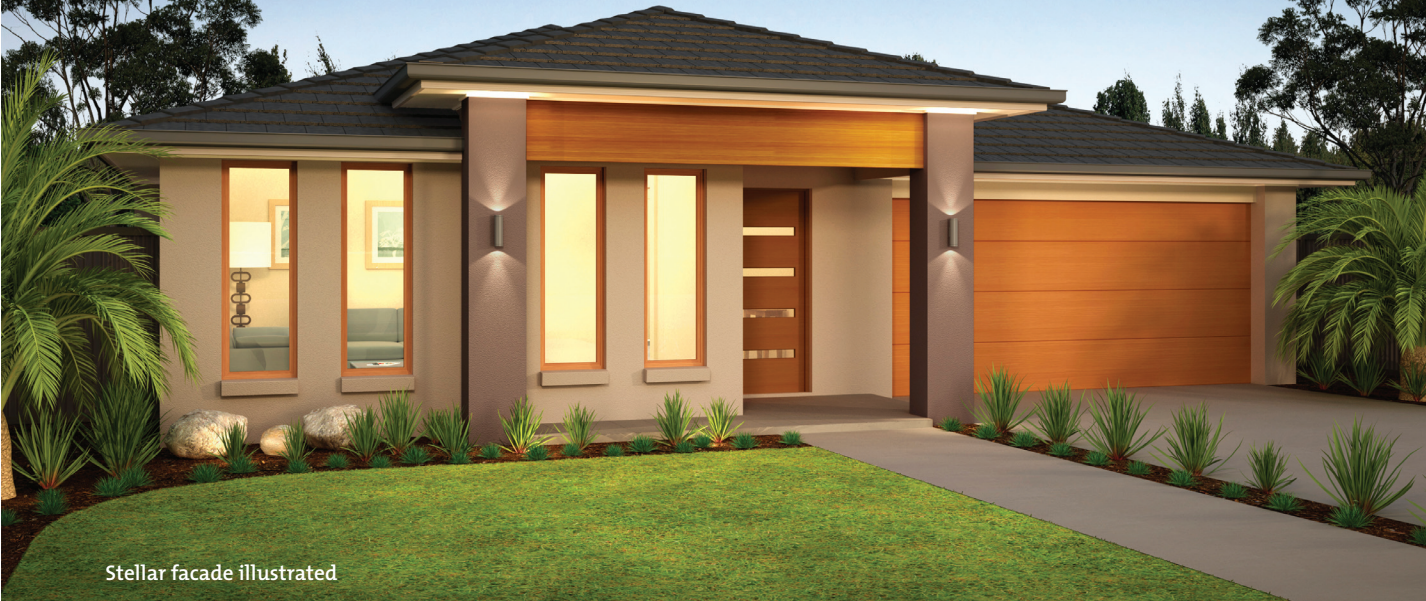
Stellar facade illustrated