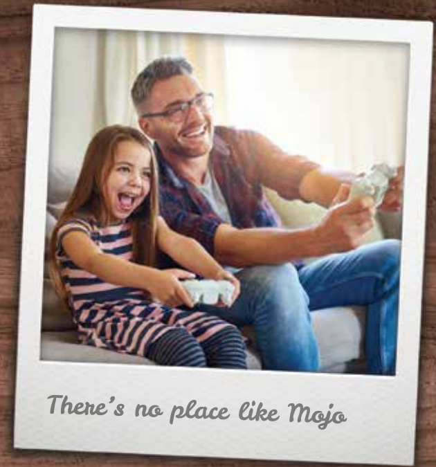
There's no place like Mojo