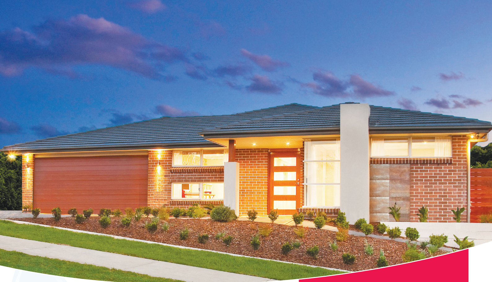
Optional Constantine facade with optional study.