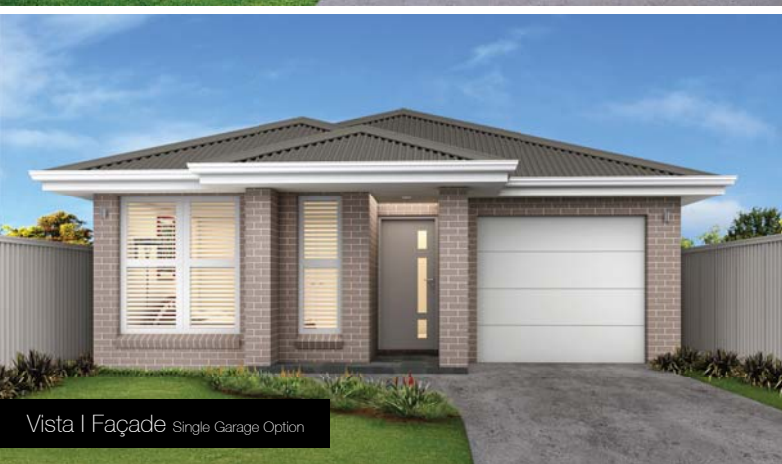
Vista I Façade Single Garage Option