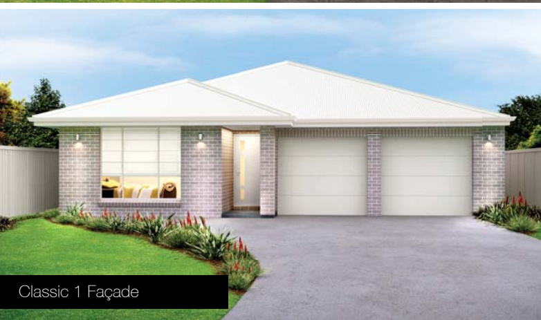
Classic 1 Façade