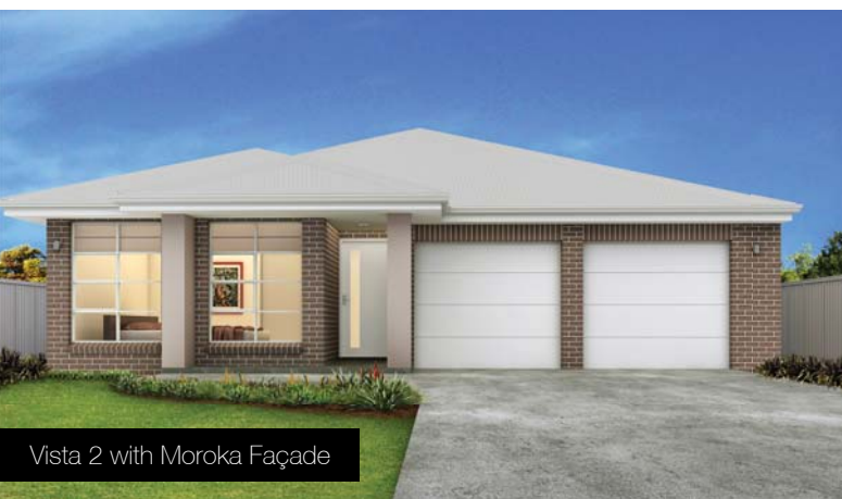
Vista 2 with Moroka Façade