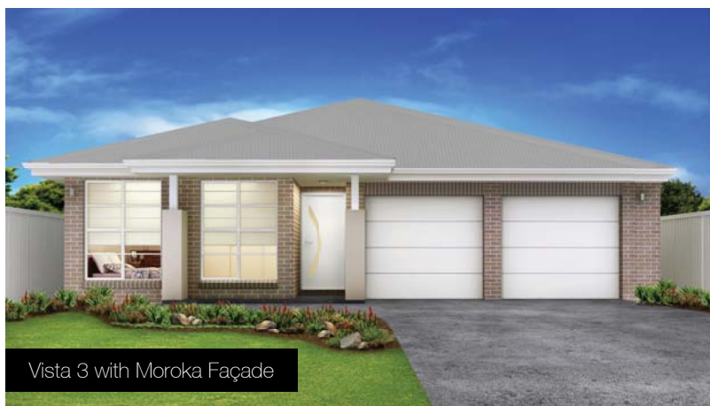
Vista 3 with Moroka Façade

The facades featured are for illustrative purposes only and may not depict actual inclusions included in prices. It is at the client's discretion to select inclusion features within the standard ranges and if optional upgrades are requested (subject to availability), additional costs will incur. Taubmans® Moroka finish is only included to facades where mentioned. Various facades may alter dimensions and structures to plans. Landscaping, driveway, fences, letterbox, light fixtures (internal and external), window coverings, decorative accessories, home furnishings and most appliances are not included in quoted prices (see inclusions page 10 for more details). Builders licence number 207765C.