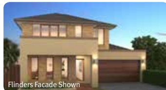
Flinders Facade Shown