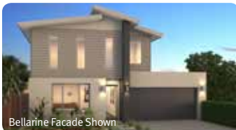
Bellarine Facade Shown