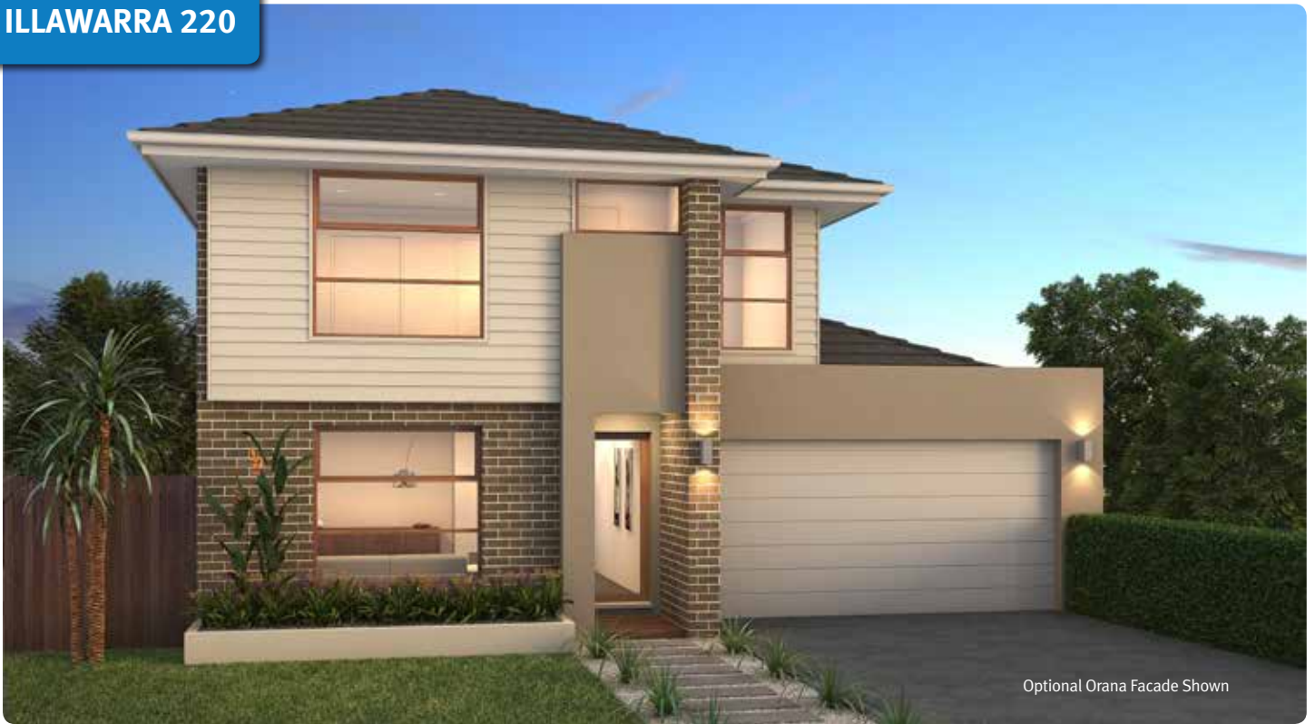
Optional Orana Facade Shown