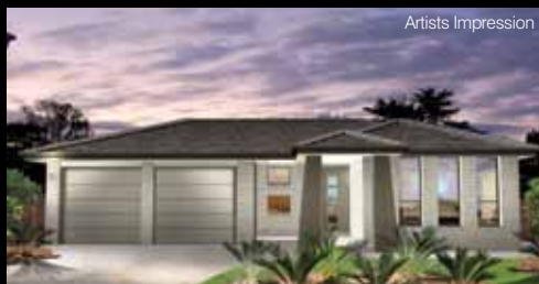
ULTRA MEDITERRANEAN FACADE