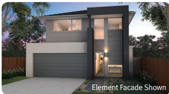
Element Facade Shown