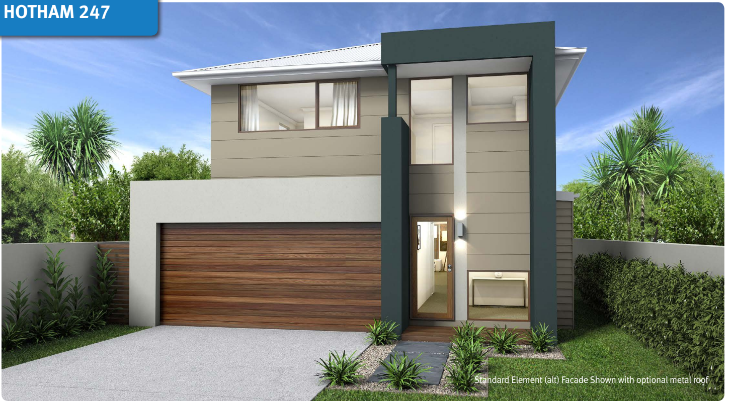
Standard Element (alt) Facade Shown with optional metal roof