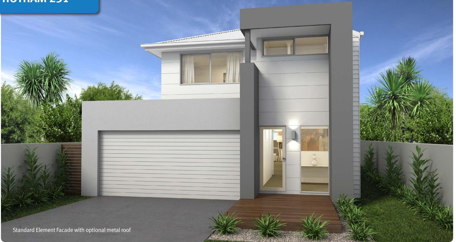
Standard Element Facade with optional metal roof