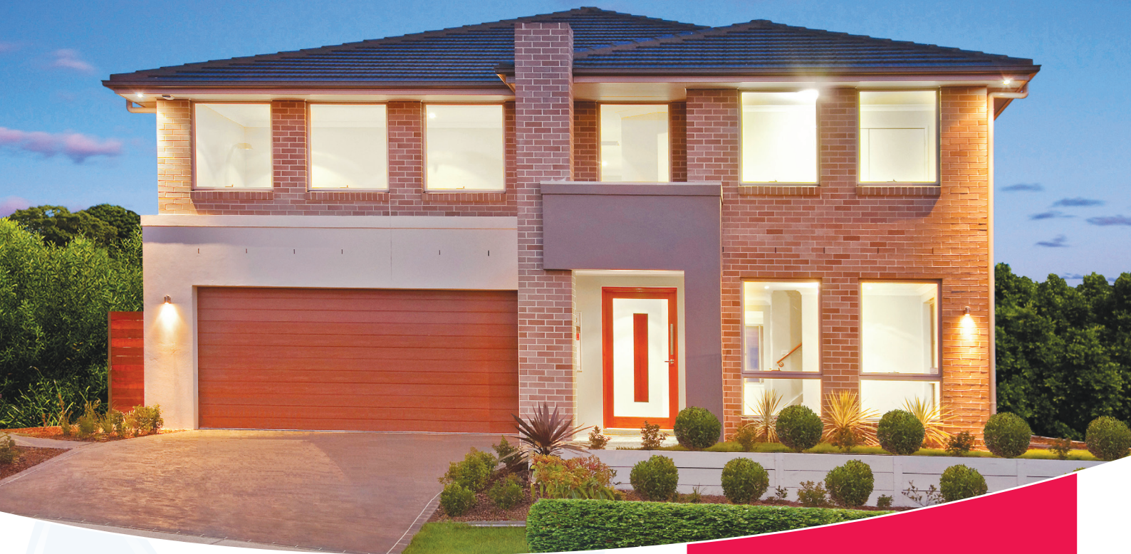
Optional Caesar facade.