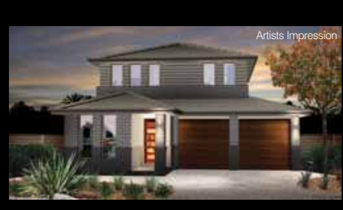
CLASSIC OAKWOOD FACADE