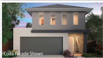
Coda Facade Shown