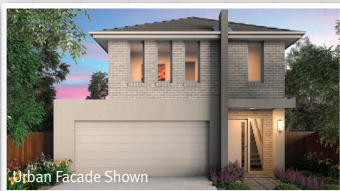
Urban Facade Shown