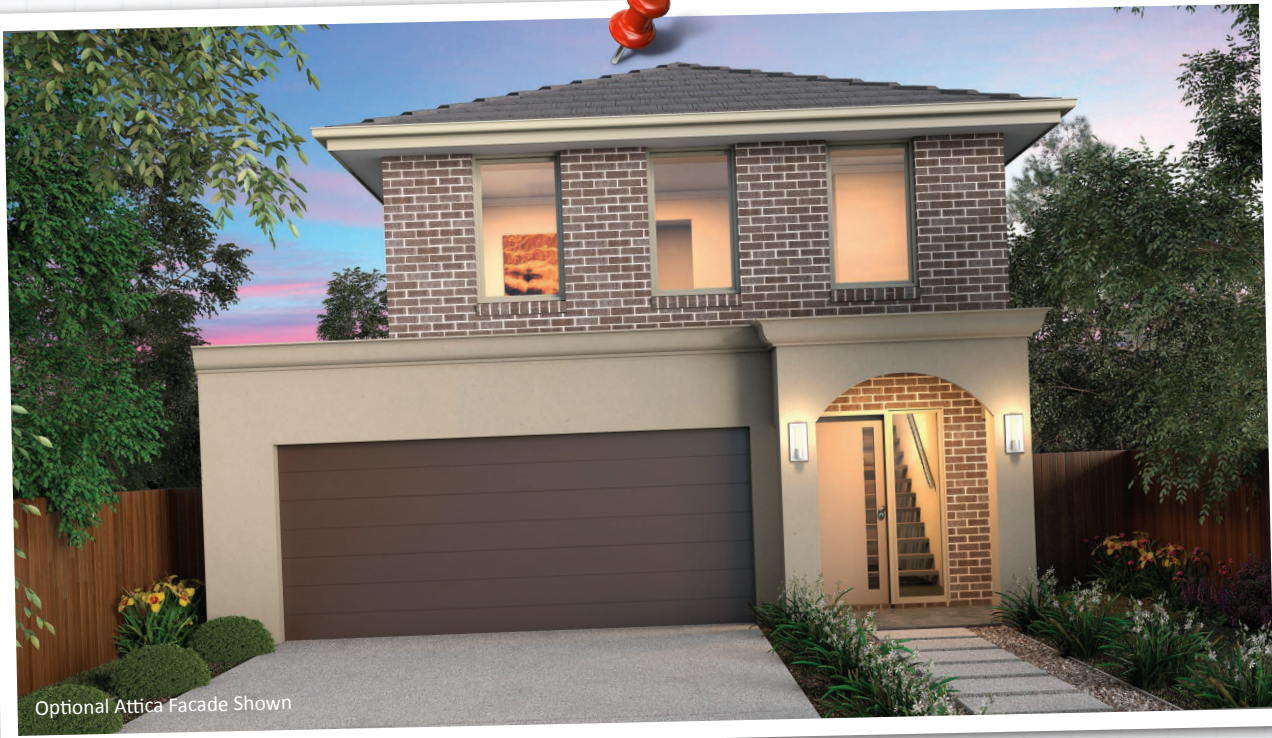
Optional Attica Facade Shown