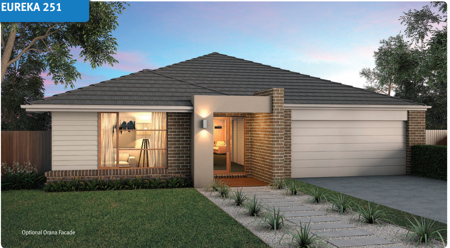
Optional Orana Facade