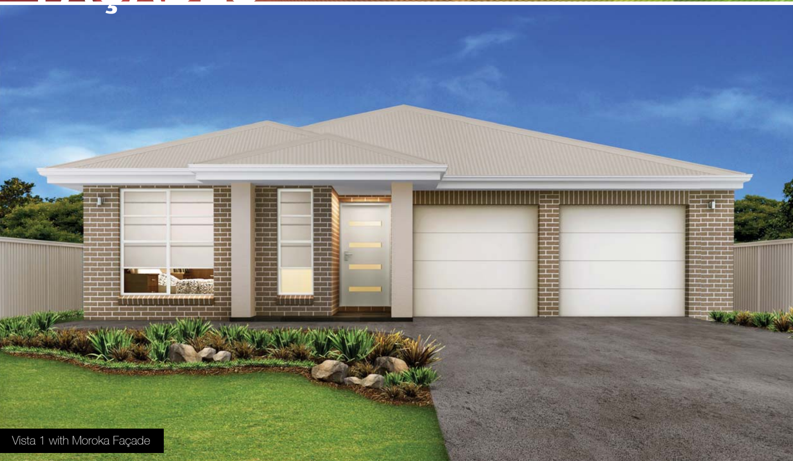
Vista 1 with Moroka Façade