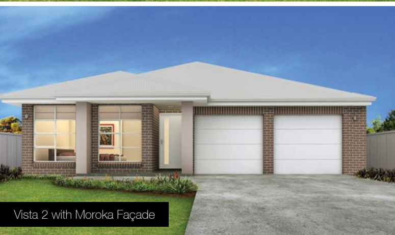
Vista 2 with Moroka Façade