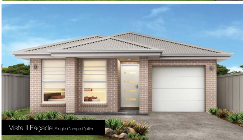
Vista II Façade Single Garage Option

The facades featured are for illustrative purposes only and may not depict actual inclusions included in prices. It is at the client's discretion to select inclusion features within the standard ranges and if optional upgrades are requested (subject to availability), additional costs will incur. Taubmans® Moroka finish is only included to facades where mentioned. Various facades may alter dimensions and structures to plans. Landscaping, driveway, fences, letterbox, light fixtures (internal and external), window coverings, decorative accessories, home furnishings and most appliances are not included in quoted prices (see inclusions page 10 for more details). Builders licence number 207765C.