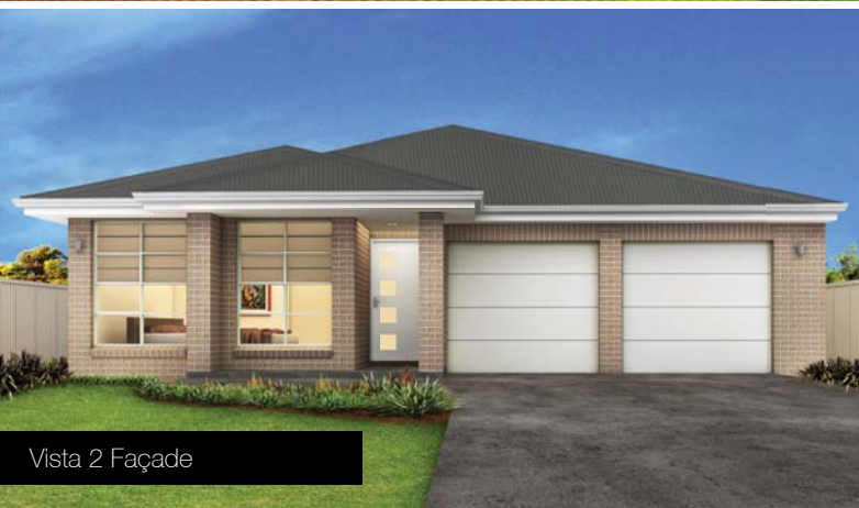
Vista 2 Façade