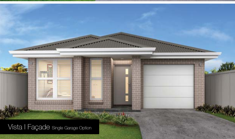
Vista I Façade Single Garage Option