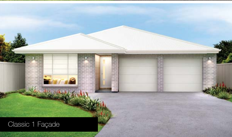
Classic 1 Façade