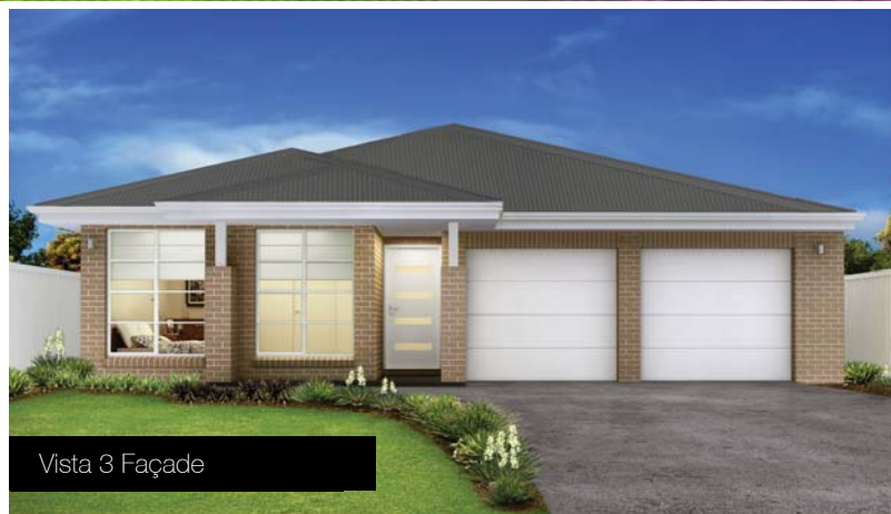
Vista 3 Façade