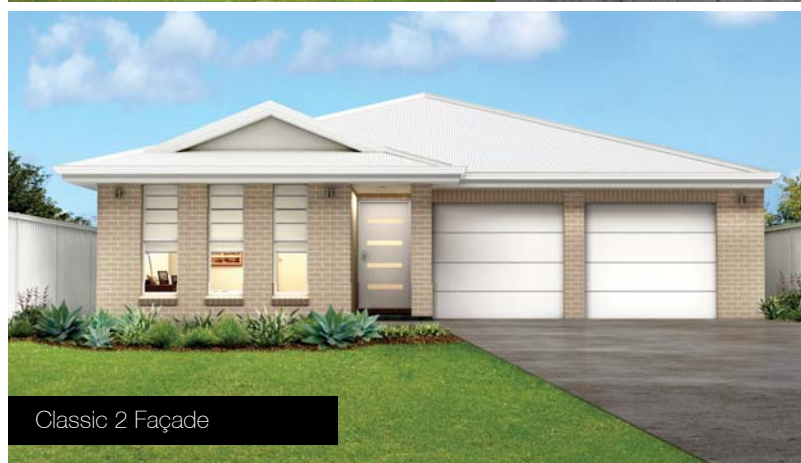
Classic 2 Façade