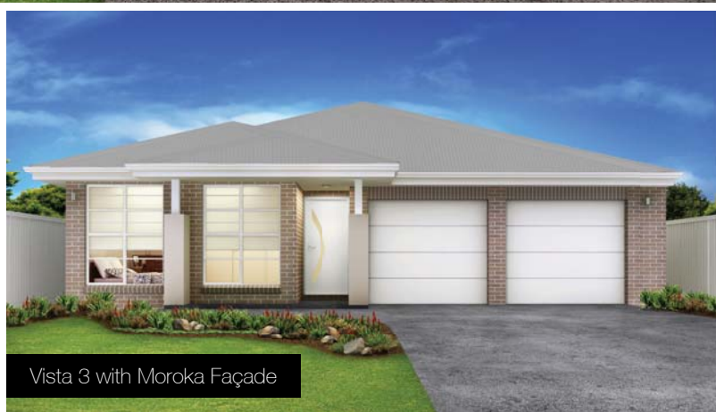
Vista 3 with Moroka Façade

The facades featured are for illustrative purposes only and may not depict actual inclusions included in prices. It is at the client's discretion to select inclusion features within the standard ranges and if optional upgrades are requested (subject to availability), additional costs will incur. Taubmans® Moroka finish is only included to facades where mentioned. Various facades may alter dimensions and structures to plans. Landscaping, driveway, fences, letterbox, light fixtures (internal and external), window coverings, decorative accessories, home furnishings and most appliances are not included in quoted prices (see inclusions page 10 for more details). Builders licence number 207765C.