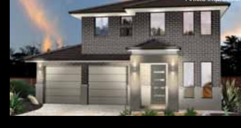
ULTRA CLASSIC FACADE