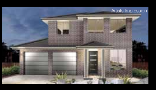
CLASSIC OAKWOOD FACADE CONTEMPORARY FACADE