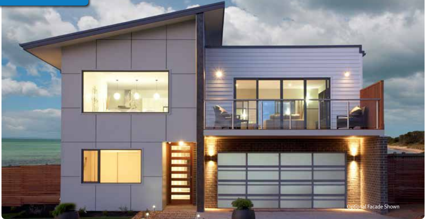
Optional Facade Shown