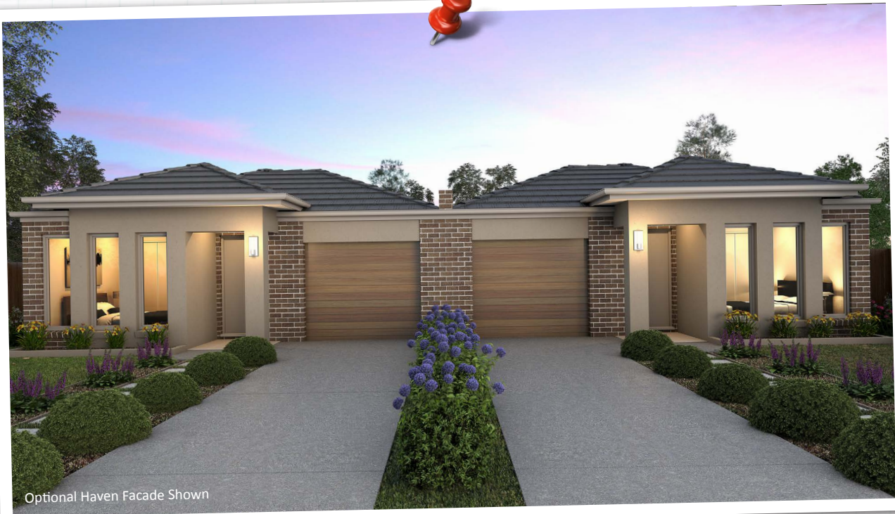
Optional Haven Facade Shown