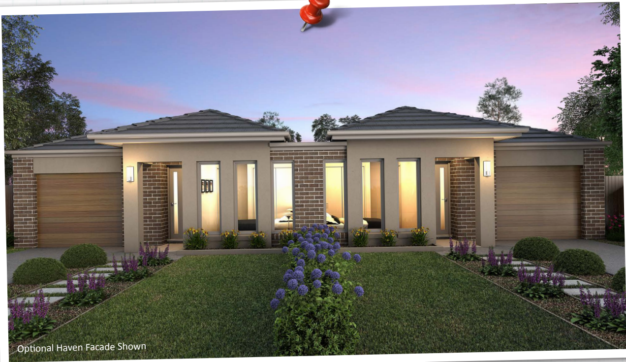
Optional Haven Facade Shown