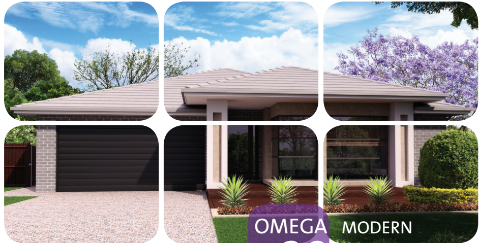
OMEGA 29 MODERN