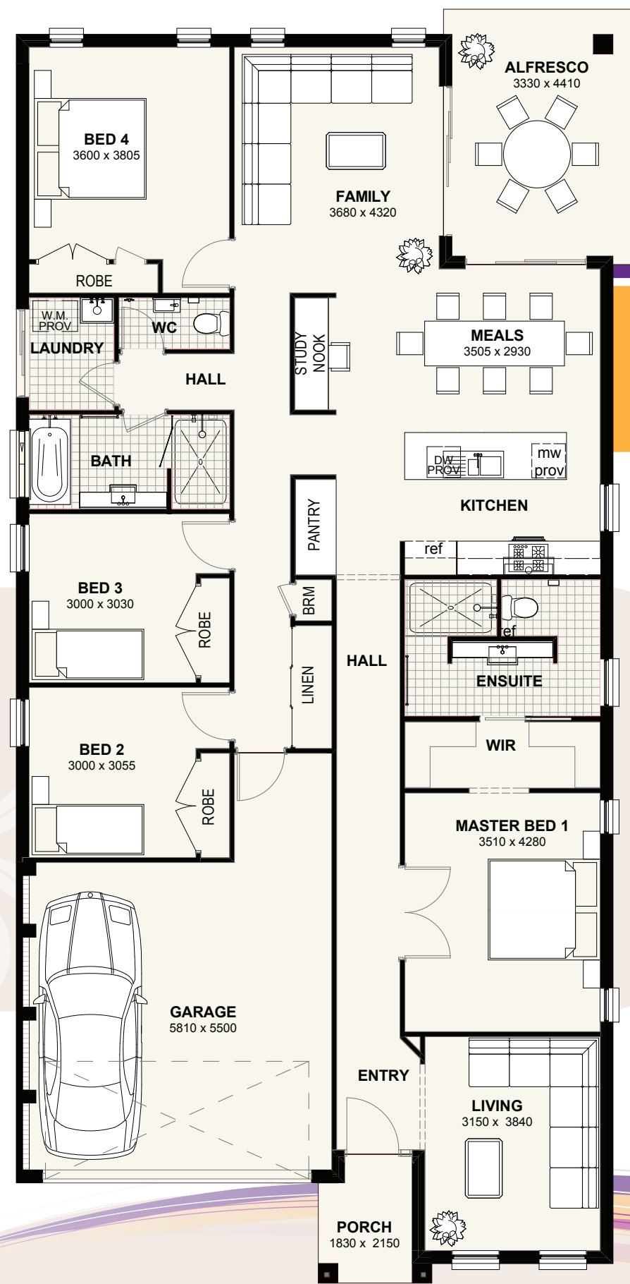
CLASSIC FLOOR PLAN SHOWN